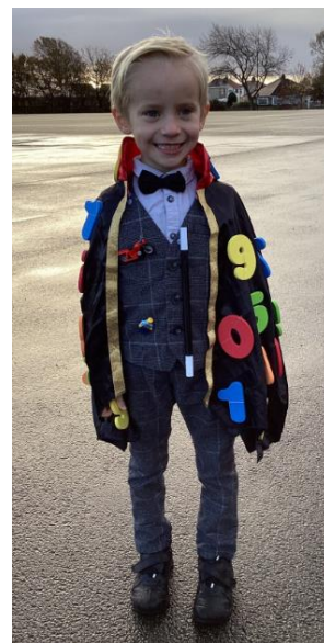
Our Westgate Math-magician!